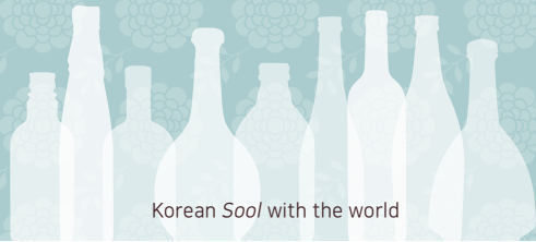
Korean Sool/ with the world